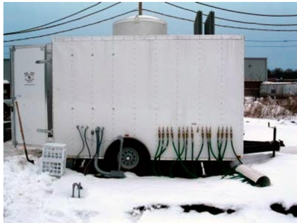
Portable oxygen delivery system designed by XDD. Injection lines are connected to valves on the exterior of the trailer.

long-term data coupled with soil sampling data are used to fine tune the configuration of the oxygen sparge sequence in order to target areas of higher contamination.